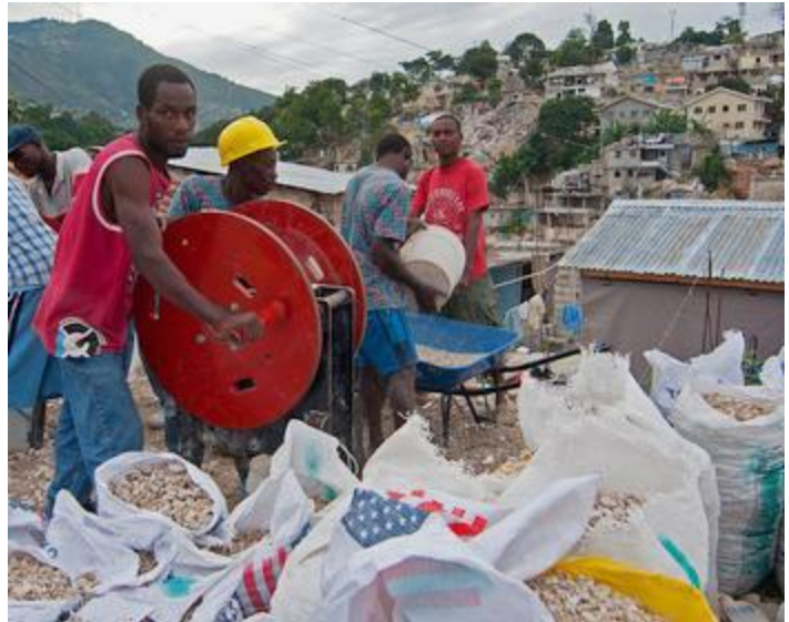
Crushing rubble for concrete in Haiti

inferior quality, can be effectively used as recycled coarse aggregate in new construction and still achieve strength requirements of 3,000 pounds per square inch.