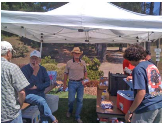
Great hot dogs were served to golfers

On September 6, our Rotary Club held its annual Golf Tournament at Little River Inn. A large percentage of Rotarians turned out to participate and help with this important club fundraising event. Special thanks go to Ron