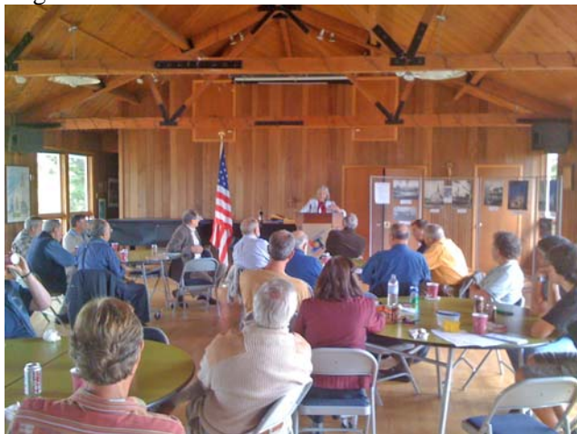
Preston Hall Luncheon