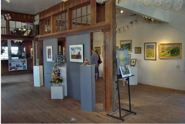
The paintings were hung, flowers set out, banners strung, and interested bidders began to come in to sample the delicious hors d'oeuvres.